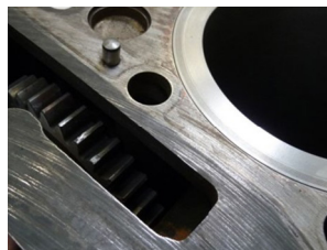
Engine block sealing surfaces with spur gear

The standard cylinder-head gaskets (thickness of 1.2 mm; Elring 021.262 or 357.831) are not intended for this purpose. The tooth flanks of the spur gears would otherwise interlock too closely with one another, which can rapidly lead to wear and damage. Elring has developed a 0.3 mm thicker cylinder-head gasket for carrying out long-term, environmentally friendly repairs on the engine. It compensates the removal of the material.