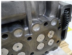
Cylinder-head sealing surface with spur gear

The constructional design of the valve control with spur gears in the cylinder-head and the engine block (see images) make it necessary for the material removed as a result of the mechanical working of the sealing surfaces to be compensated by means of a correspondingly thicker cylinder-head gasket.