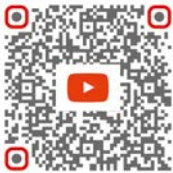
Installation videos for sealants