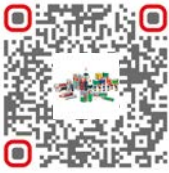
Online Sealants Adviser